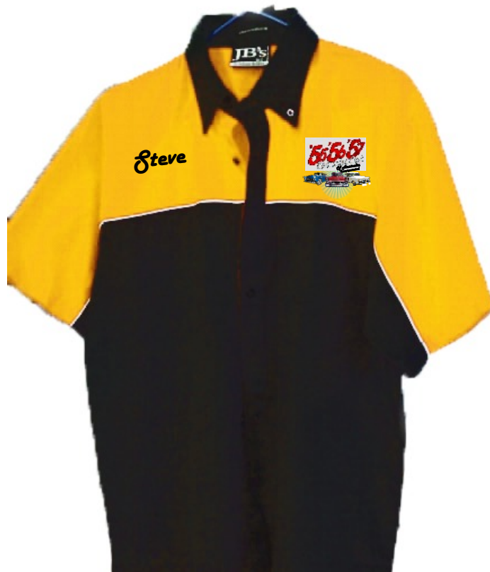
Bowling style shirts Mens Shirt $45.00