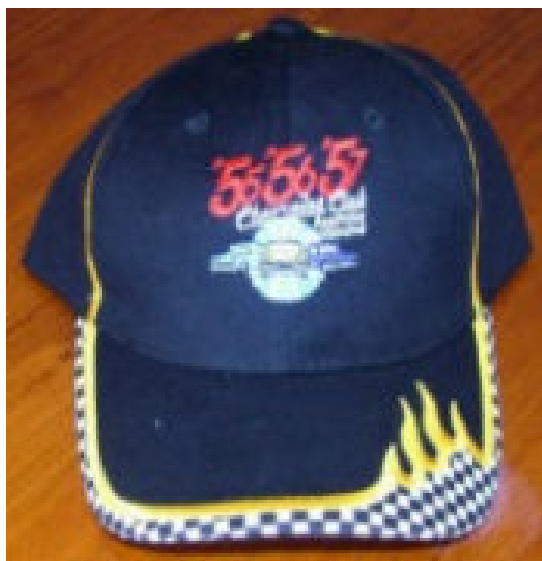
Club Cap $20.00