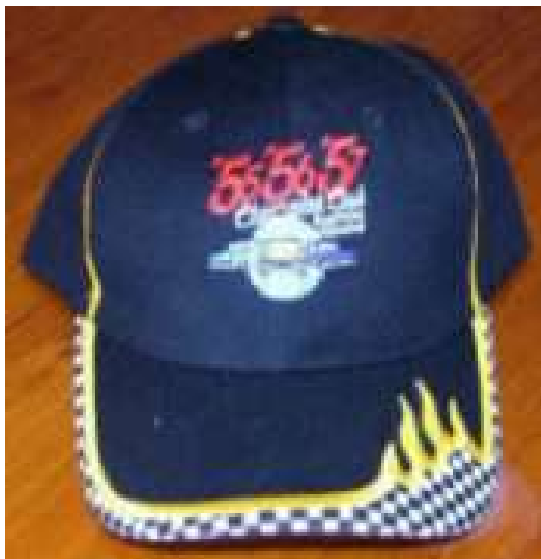
Club Cap $20.00