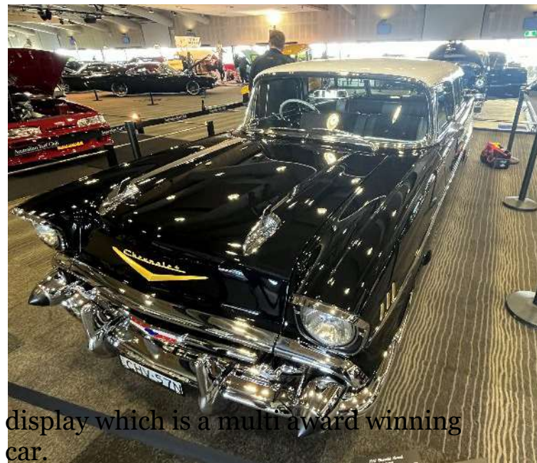
display which is a multi award winning car.