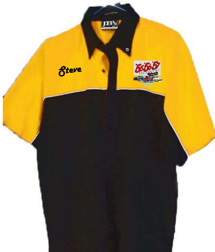
Bowling style shirts Mens Shirt $45.00